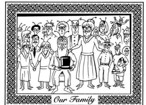
Our family portrait. Grandpa was 1 month old!

When you are in your attic, possibly putting away holiday decorations, make sure any vents there have strong, well-attached screening on them. Squirrels, rats, and other wildlife will push aside or chew around screens that are not strongly attached, and any gaps and holes then become an entry for bats and other creatures.